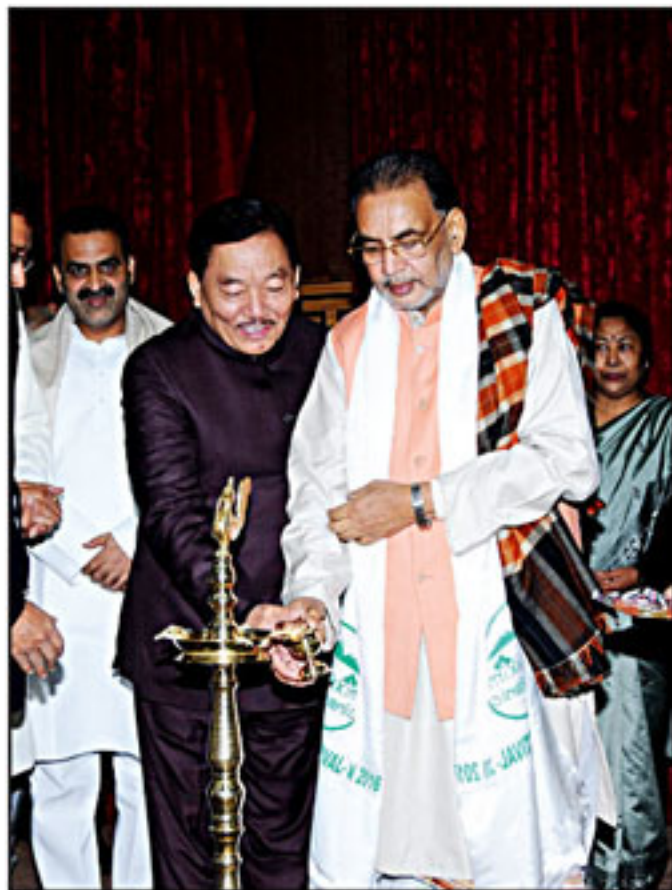
Union Agriculture minister Radha Mohan Singh and Chief Minister Pawan Chamling lighting the ceremonial lamp during the inaugural function of the agriculture conference at Chintan Bhawan.

Singh mentioned that the agricultural year 2015-16 has been a challenging one with India experiencing a deficit rainfall during kharif season and moisture stress during