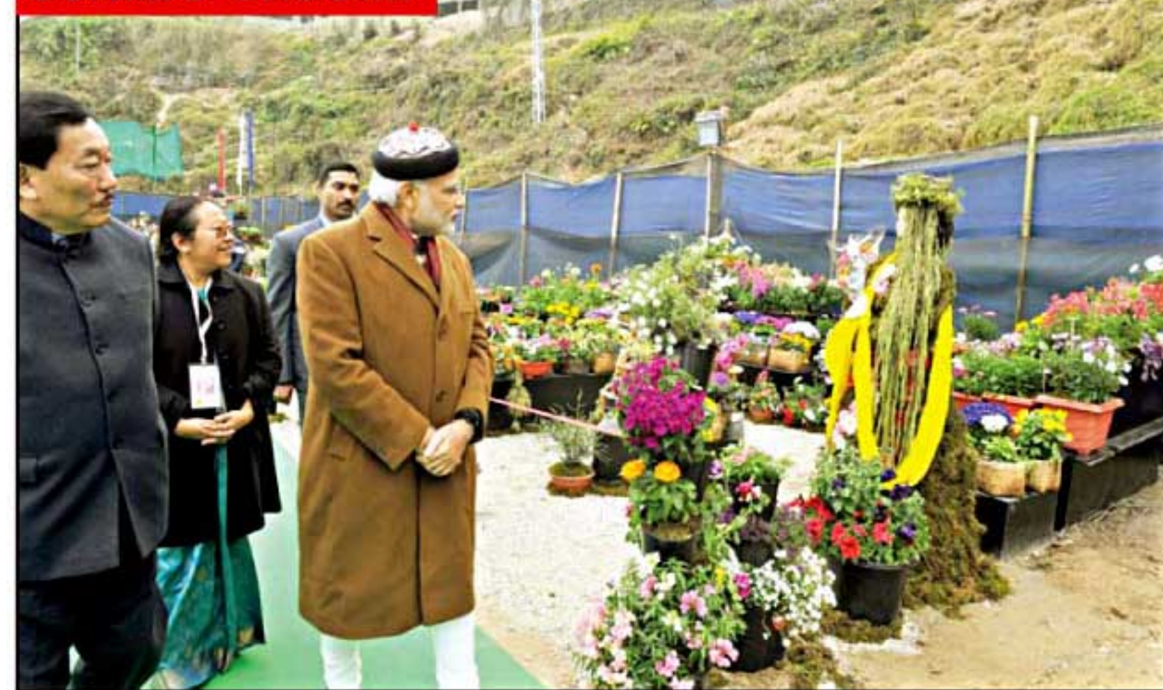
Prime Minister Narendra Modi inspects the display of flowers at Guards Ground.