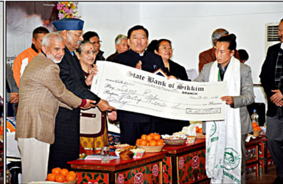
The winners of organic vegetable display receiving their prize cheques from Governor Shrinivas Patil, Chief Minister Pawan Chamling and Agriculture minister Somnath Poudyal.