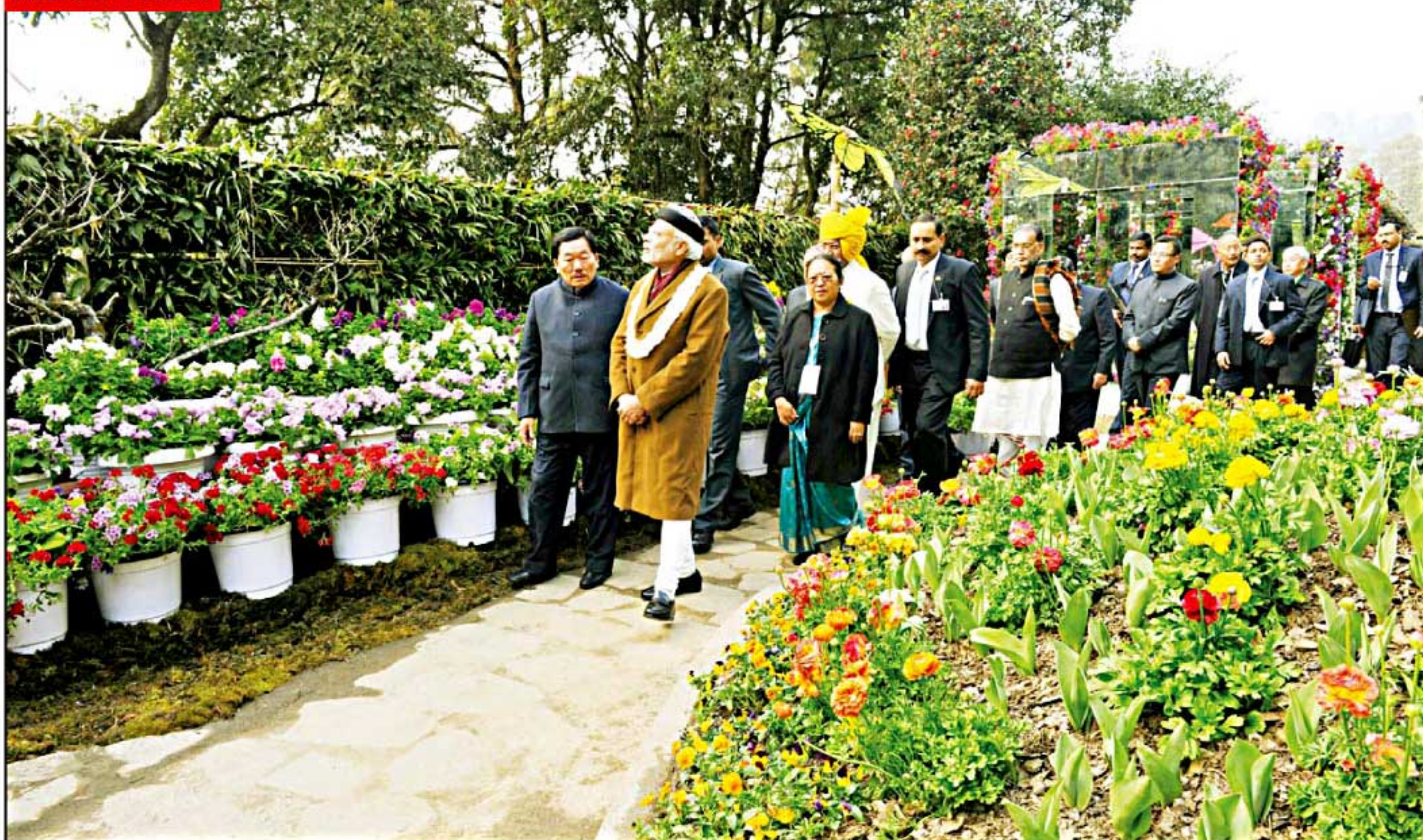
Prime Minister Narendra Modi inspects the display of orchids and seasonal flowers at Ridge Park. He is accompanied by Governor Shrinivas Patil, Chief Minister Pawan Chamling, Tika Maka Chamling, Union Agriculture minister Radha Mohan Singh and other dignitaries.