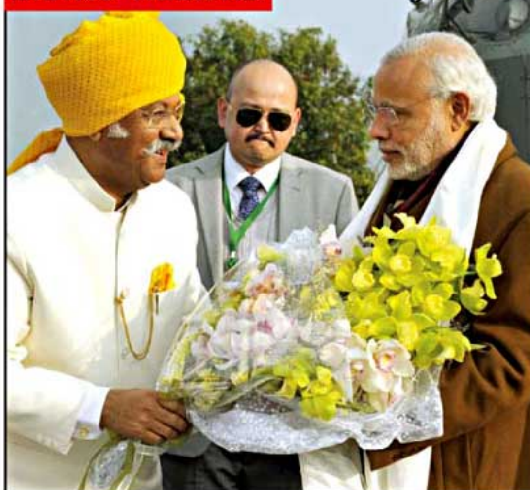
Governor Shrinivas Patil welcomes Prime Minister Narendra Modi at Libing helipad.